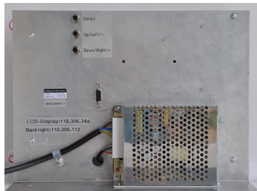
Illustration 1: Device back view

The power supply, a 9-pin connector for connecting the video signal, as well as three buttons are mounted on the back side of the device (see Illustration 1).