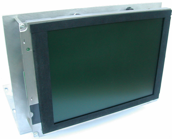
Illustration 2: Device front view

The device consists of a L-shaped plate, whereon the TFT screen, the controller board, the backlight converter, and the power supply are mounted (refer to Illustration 1 and Illustration 2).