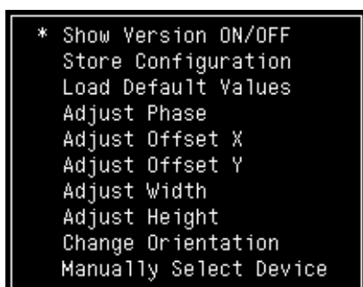
Illustration 5: On Screen Main Menu